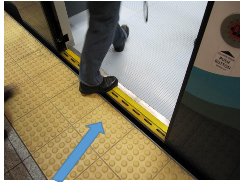
Fully-level Boarding - No bridge plate, ramp or step